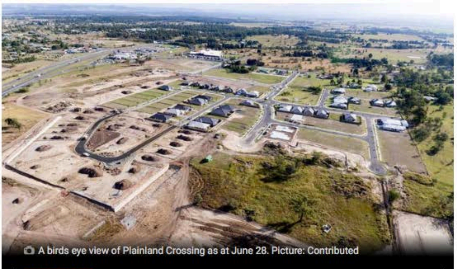
A birds eye view of Plainland Crossing as at June 28.