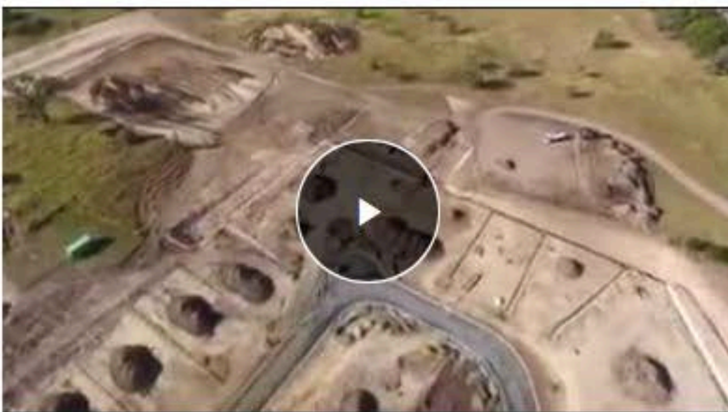
Plainland Crossing, June 2017: Work is underway for Plainland Crossing.

With construction well under way, the site is quickly becoming a large residential area, along with the development of shopping centres, schools and other businesses.